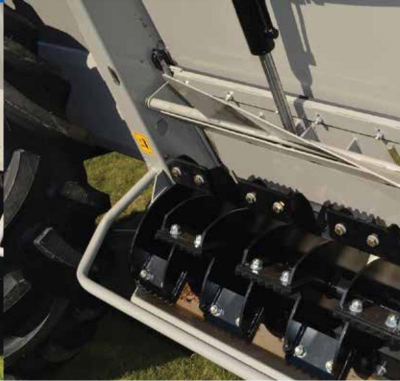
• Discharge rotor with reversible wear plates