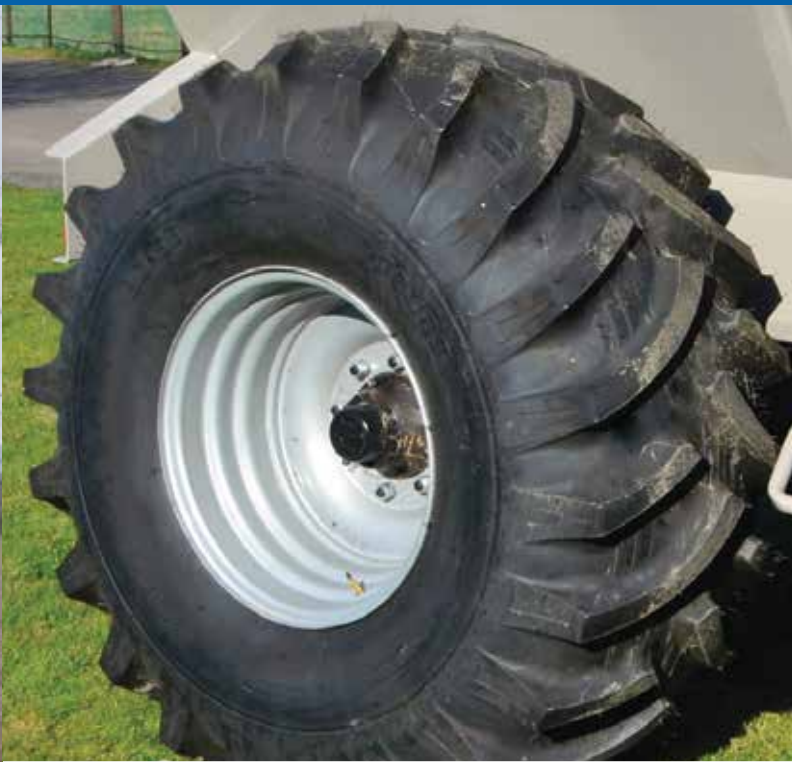
• Standard: 23.1 - 26 16ply standard tyres