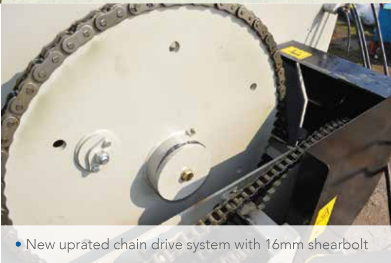
• New updated chain drive system with 16mm shearbolt