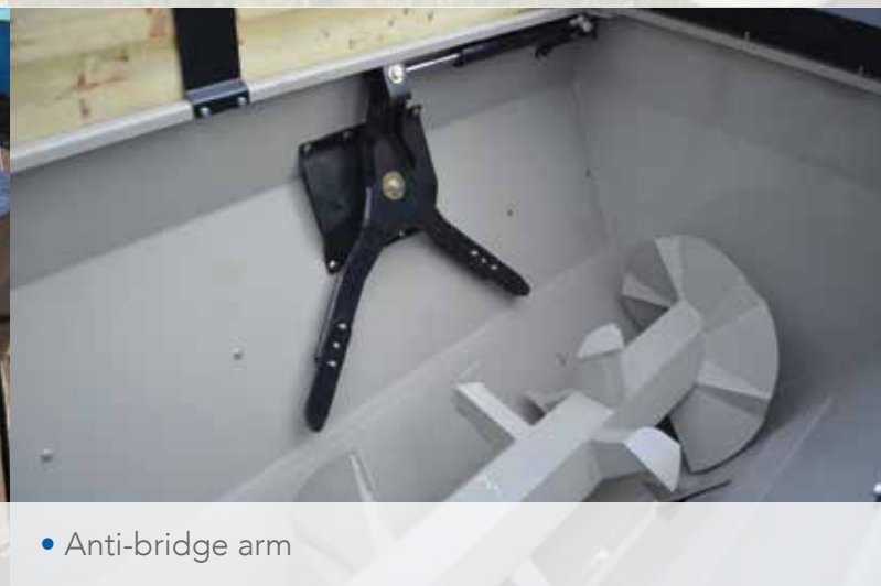
• Anti-bridge arm